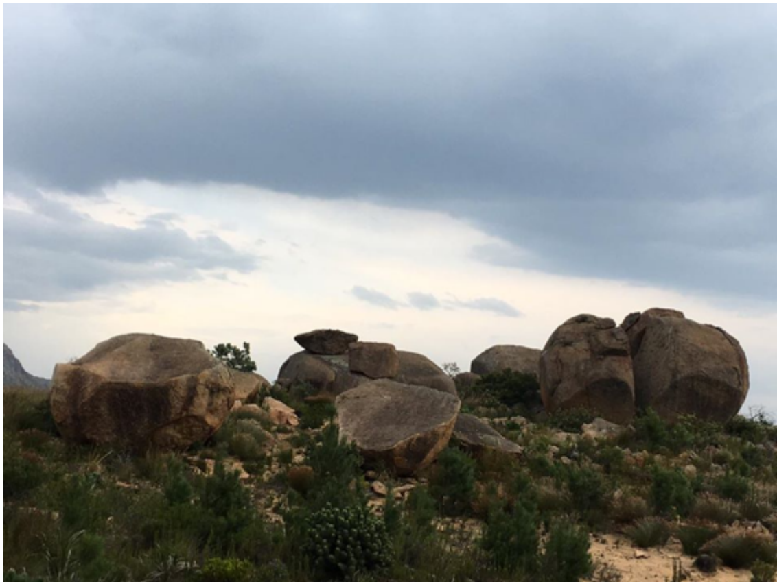
Photo 2. Some boulders in the upper area.

This is quite a large area and has not been subdivided into smaller manageable chunks to navigate. So, at this point in time, just explore!